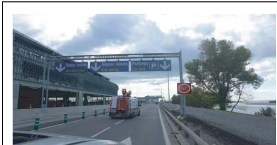
2. Follow Parking – keep right.