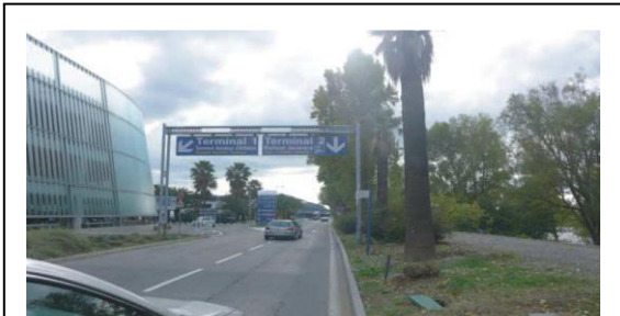
1. Nice Airport Azure direction Terminal 2.