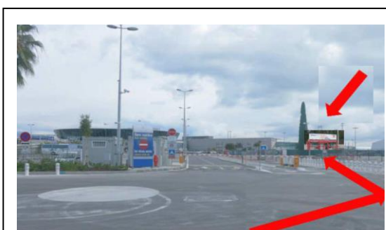
4. Enter through an automated gate then look for the (red) TT Car office.